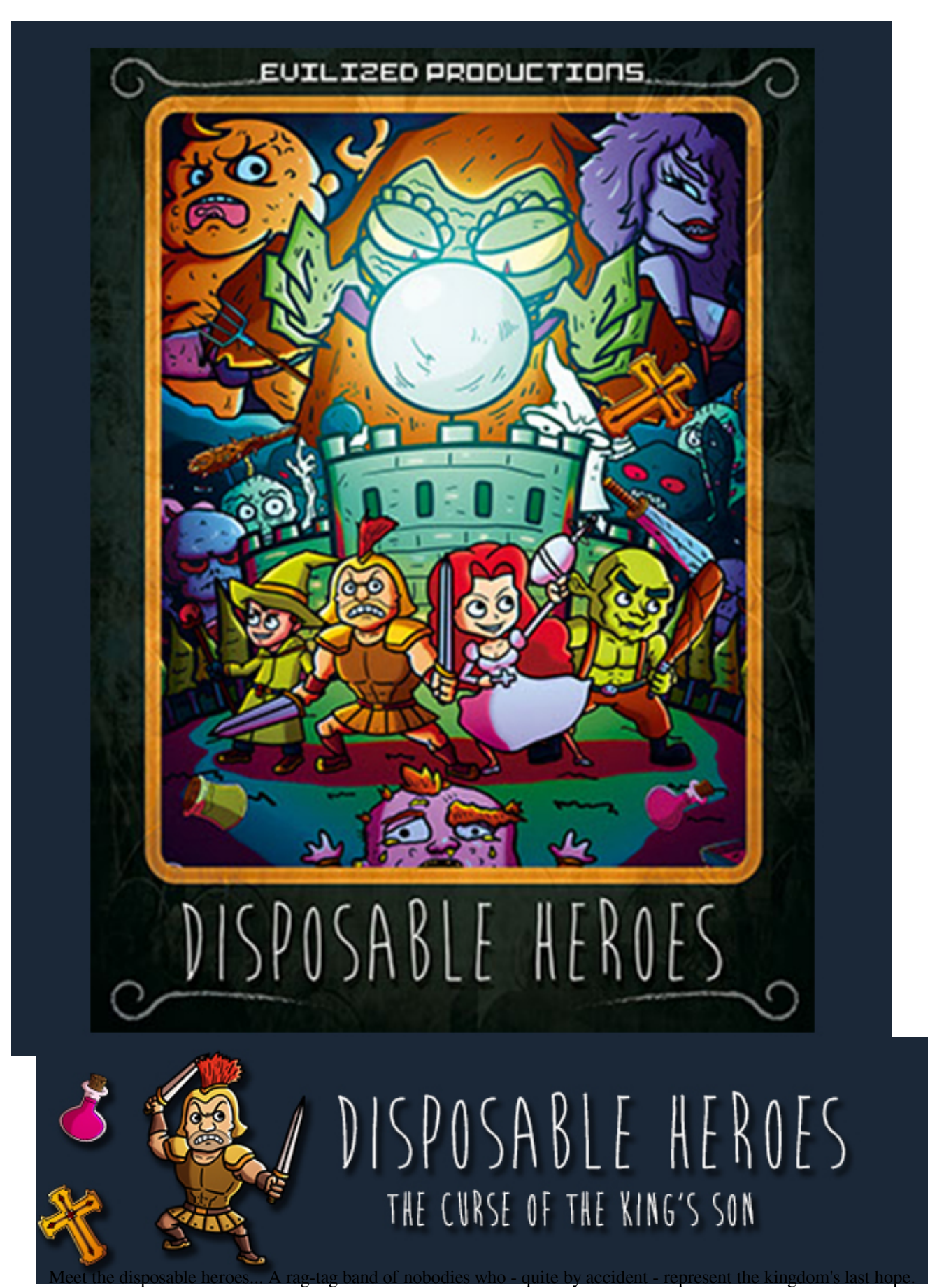
With the royal army slain it is they who must venture across the land on a quest to bring back the head of the king's son so that